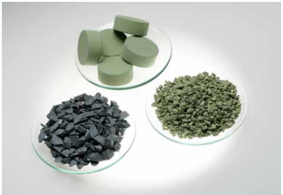
Selection of ITO Products for Evaporation

Indium Tin Oxide can be used in Evaporation Systems for depositing thin conductive transparent layers for a variety of applications such as LED, sensors, and antistatic coatings. The desired combination of electrical conductivity and optical properties is achieved by varying In/Sn mixing ratio and process conditions.